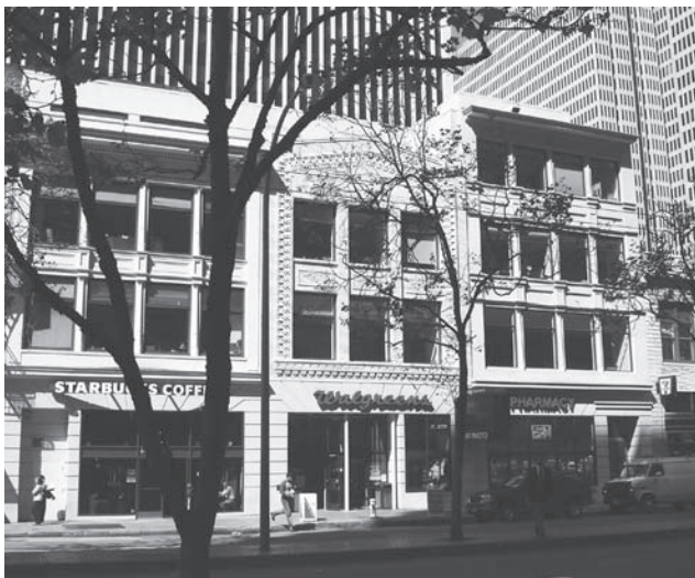
The ACLU-NC's new building.

ACLU-NC will be centrally located, adjacent to the Embarcadero MUNI/BART transit station and just blocks from the San Francisco ferry and bus terminals. The new headquarters position us near law firms (of cooperating counsel and other public interest organizations), the courts, public officials, and media outlets. This move also returns us to our historic roots—locating the ACLU-NC near the site of the 1934 General